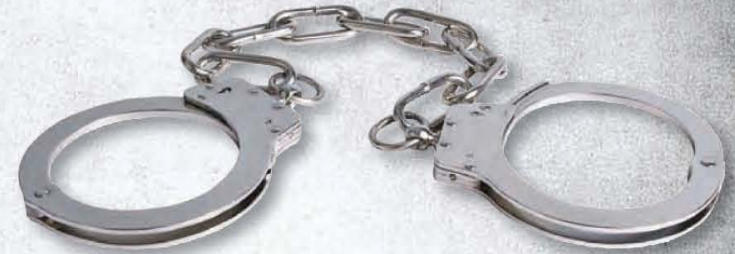
9000/9000C Legcuffs 5259 Extra Oversize Legcuffs