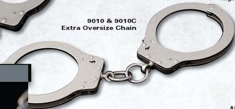
9010 & 9010C Extra Oversize Chain