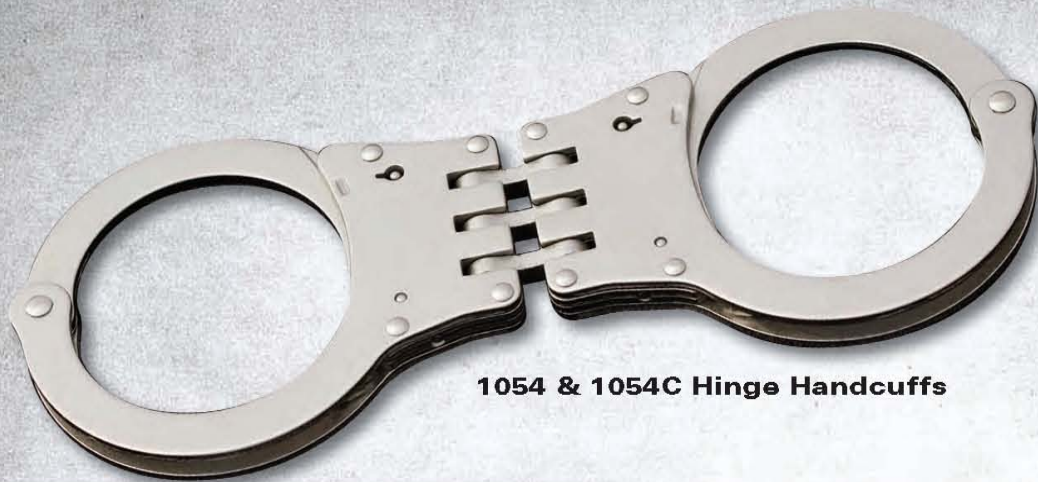
1054 & 1054C Hinge Handcuffs