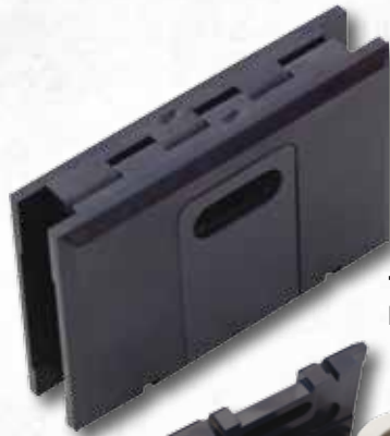
7084 Blue Box™ for chain cuffs

CTS-Thompson offers a variety of keys for training and duty situations.