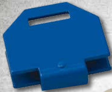
7083 Blue Box™ for hinge cuffs