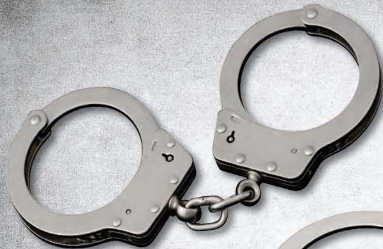
1010 & 1010C Traditional Chain 1003 & 1003C Oversize Chain